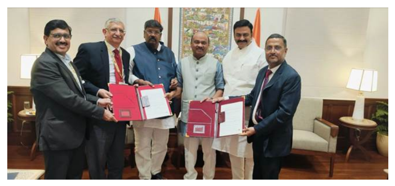
Signing of MoU with Andhra Pradesh Legislature on 25<sup>th</sup> November, 2024 in New Delhi