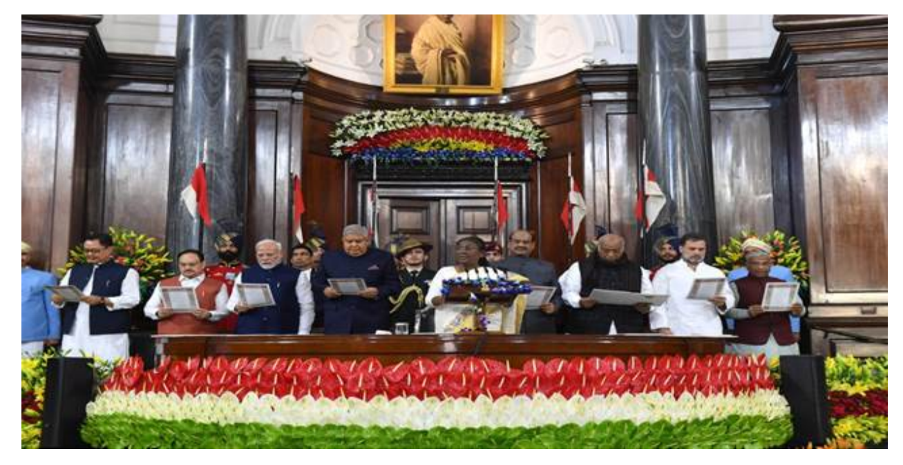
Mass reading of Preamble with President of India on 26<sup>th</sup> Nov, 2024 from Central Hall, Samvidhan Sadan, New Delhi