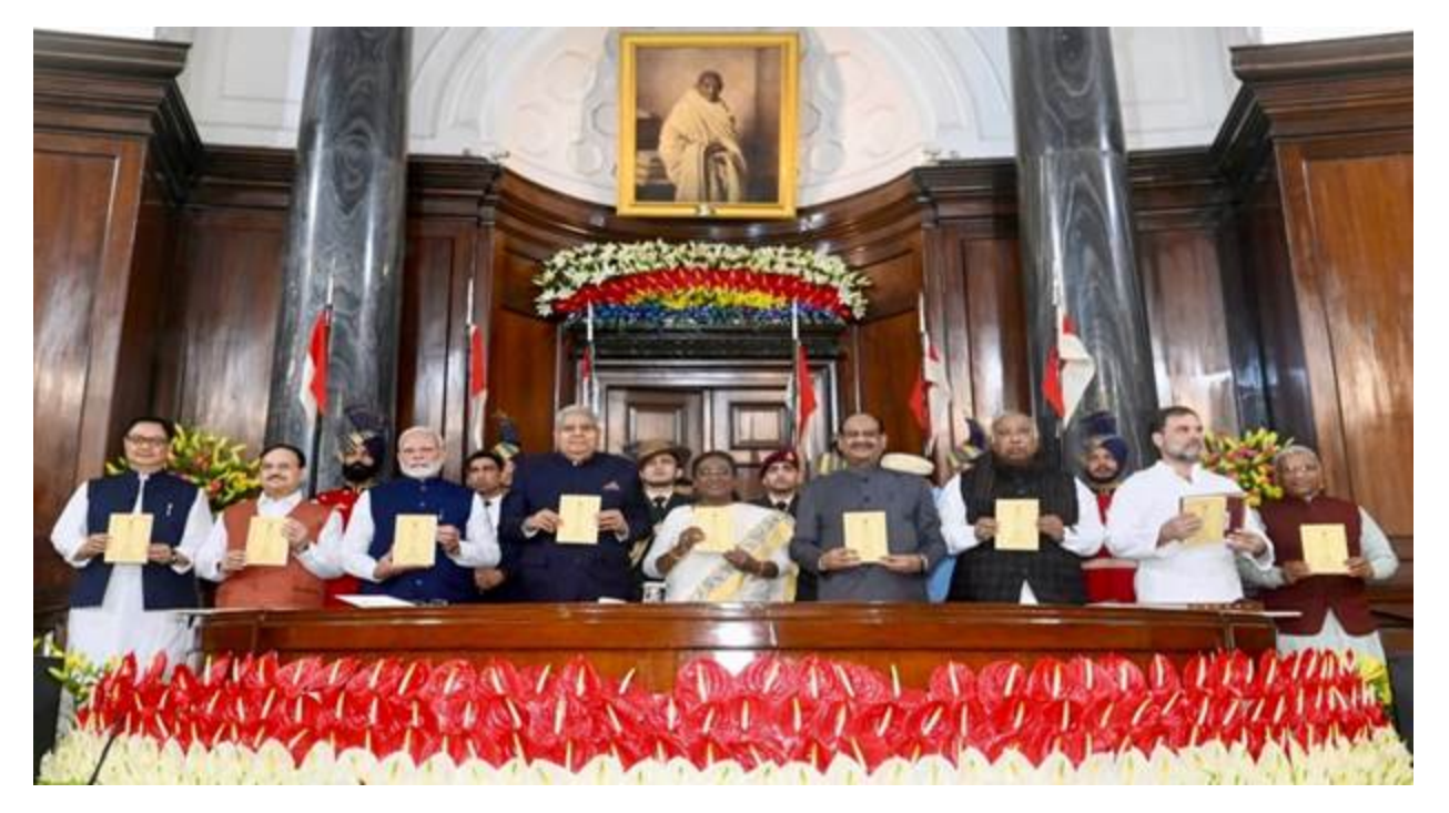
Release of the Constitution of India in Sanskrit and Maithili on Constitution Day.