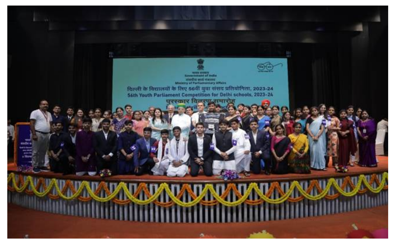
PDF of 56<sup>th</sup> Youth Parliament Competition for Delhi Schools, 2023-24 held on 6<sup>th</sup> Sep, 2024 in New Delhi