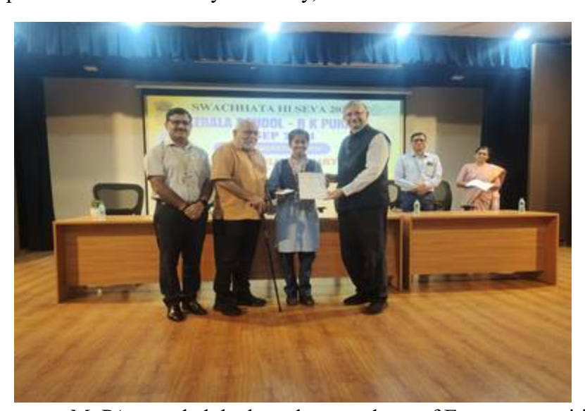
Secretary, MoPA awarded the best three students of Essay competition

To imbibe the spirit of Swachhata amongst students, an Essay writing competition was also held in the same school on the theme of SHS 2024 "Swabhaav Swachhata, Sanskar Swachhata" wherein around 120 students from different classes participated. The best three students of Essay competition were awarded with cash prize and certificates by Secretary, MoPA.