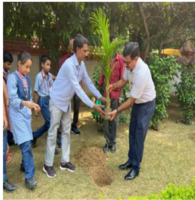
Plantation drive by senior officers of the Ministry under 'Ek Ped Maa Ke Naam' Abhiyan

To imbibe the spirit of Swachhata amongst students, an Essay writing competition was also held in the same school on the theme of SHS 2024 "Swabhaav Swachhata, Sanskar Swachhata" wherein around 120 students from different classes participated. The best three students of Essay competition were awarded with cash prize and certificates by Secretary, MoPA.