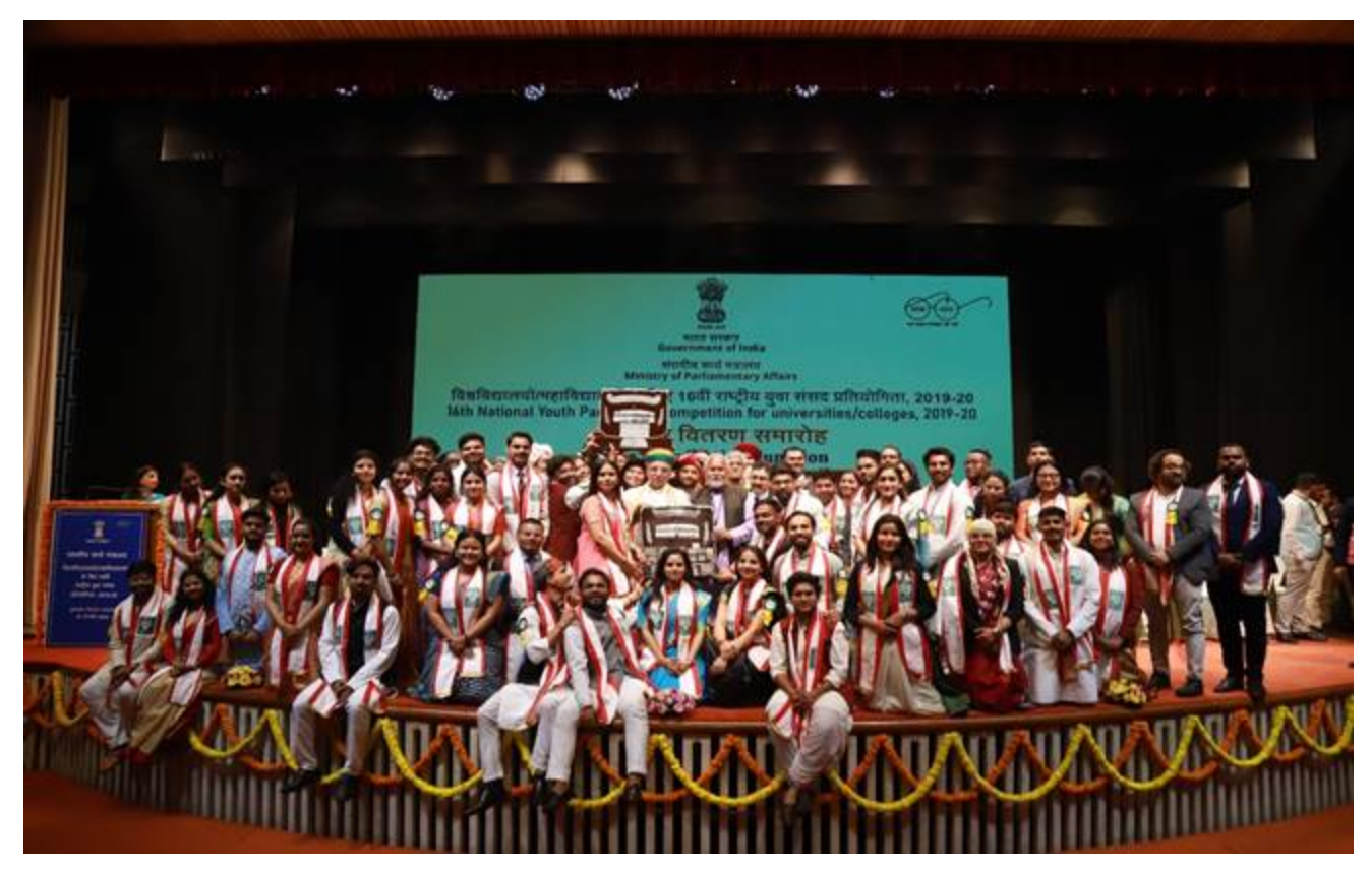
PDF 16<sup>th</sup> National Youth Parliament Competitions of Universities/Colleges, 2019-20 held on 16<sup>th</sup> Feb, 2024 in New Delhi

The Ministry of Parliamentary Affairs organizes various Youth Parliament Competitions in Kendriya Vidyalayas, Jawahar Navodaya Vidyalayas and Delhi Schools and Universities / Colleges. The Prize Distribution Functions (PDFs) for the winners of 16<sup>th</sup> National Youth Parliament Competitions of Universities/Colleges 2019-20, and 56<sup>th</sup> Youth Parliament Competition for Recognized Educational Institutions in the NCT of Delhi were organized on 16<sup>th</sup> February, 2024 and 6<sup>th</sup> September, 2024 respectively.