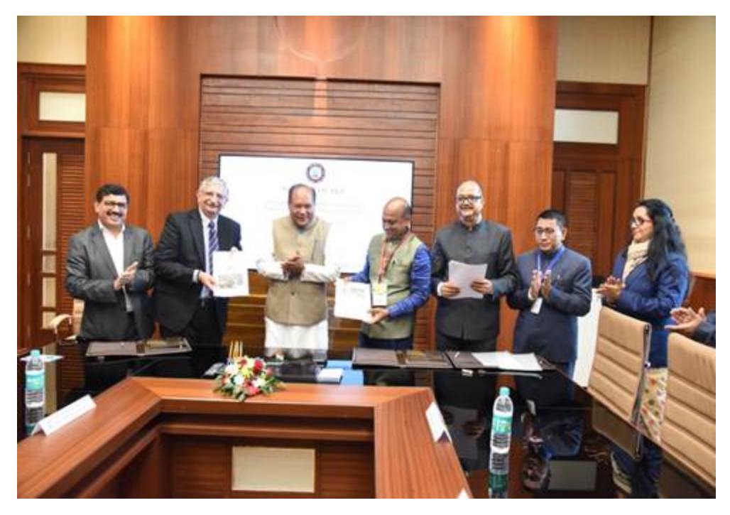
Signing of NeVA MoU with Assam Vidhan Sabha on 22<sup>nd</sup> February, 2024 in Guwahati