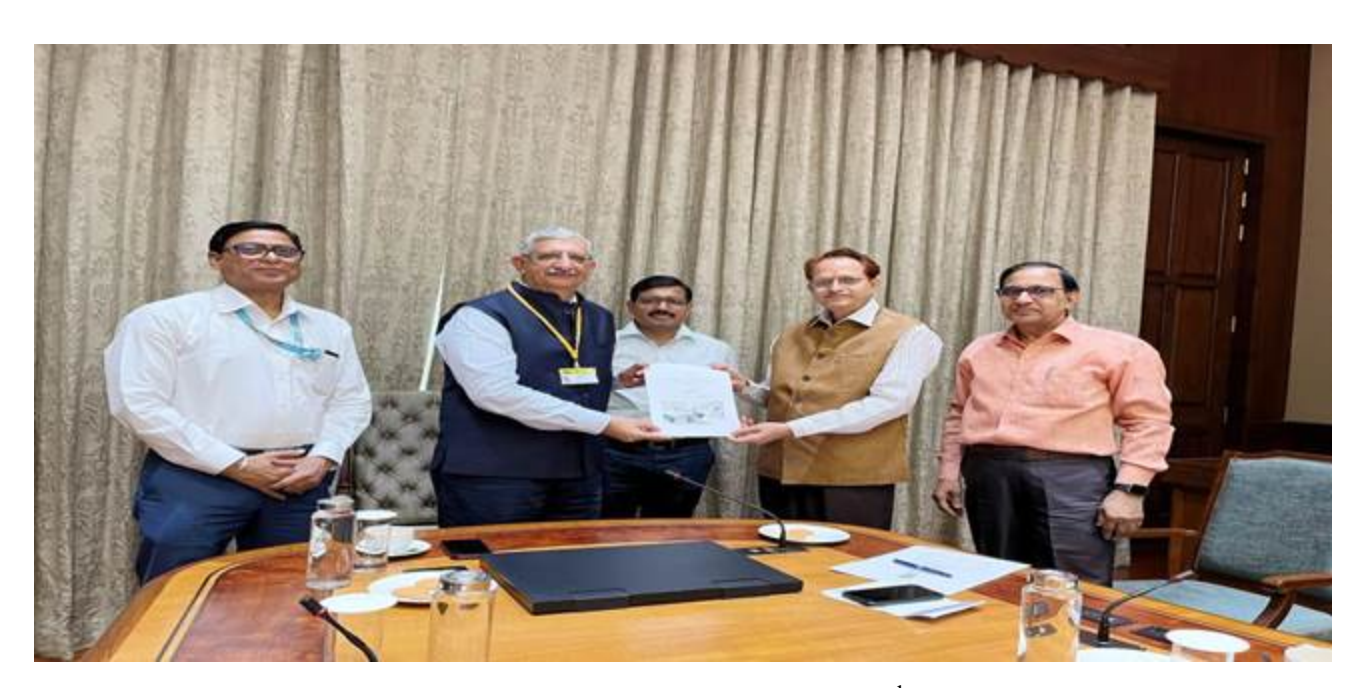
Signing of MoU with Madhya Pradesh Vidhan Sabha on 3^{\rm rd} June, 2024 in New Delhi