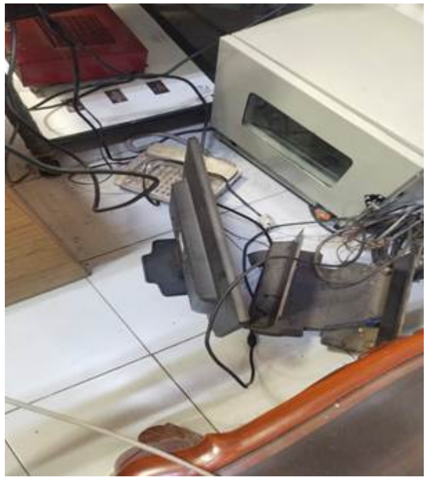
[Collection of old and obsolete electronic items for disposal]

On 29 th April, 2025, Secretary, MoPA, along with senior officers, conducted a cleanliness inspection of office premises. Following the assessment, three sections were ranked first, second, and third based on their Swachhata standards.