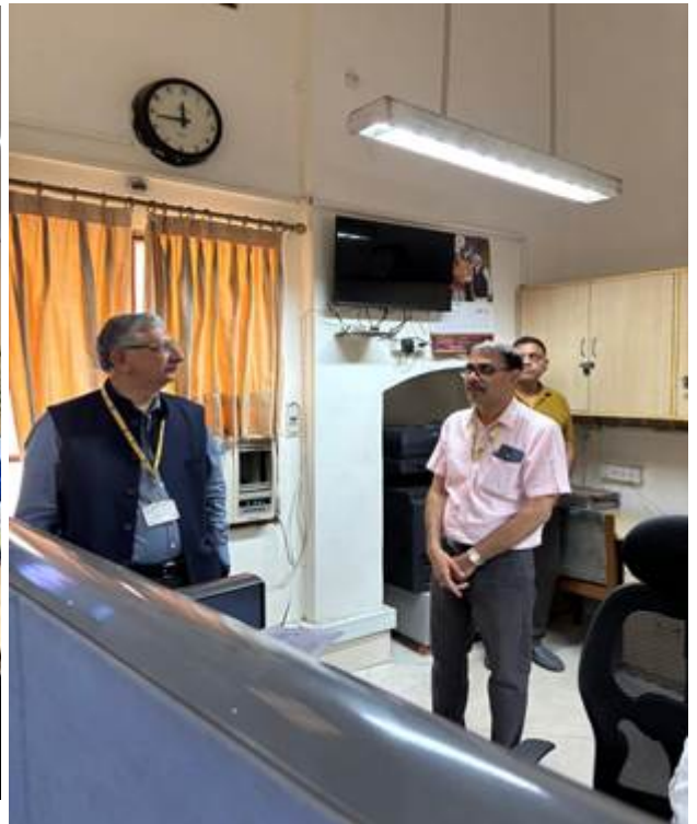
[Secretary, MoPA inspecting Cleanliness in Sections]