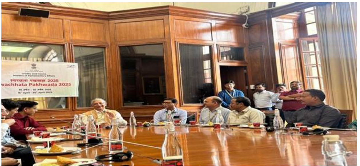
[Secretary, MoPA chairing closing ceremony of pakhwada]