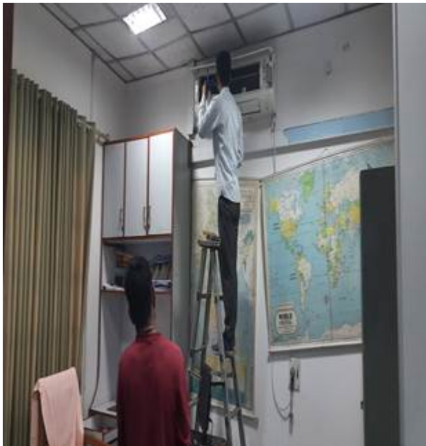
[cleaning of electrical fan/switch board]