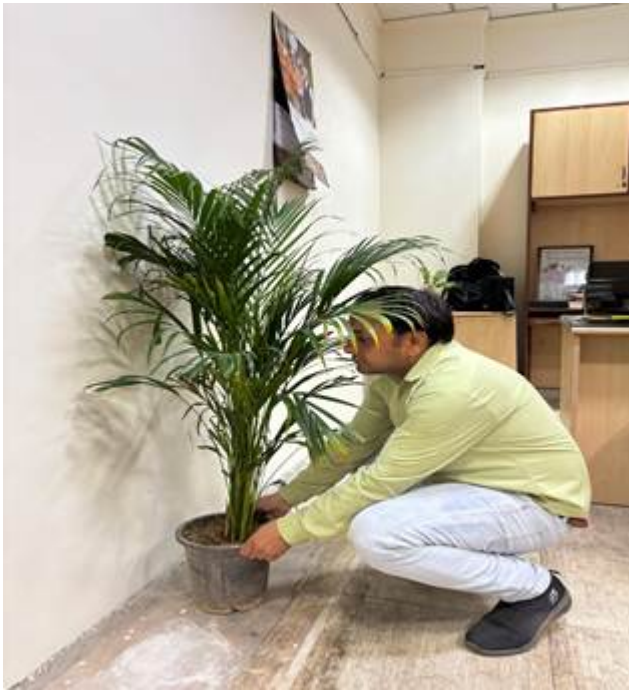
[Placing of green plants]