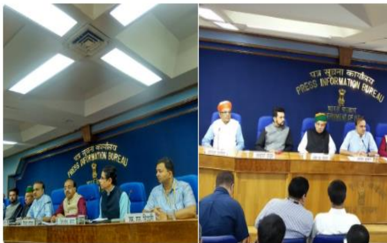
Narendra Modi and Amit Shah

informed that during the Session, Supplementary Demands for Grants for 2018-19 and Demands for Excess Grants for 2015-16 and the related Appropriation Bills, were discussed and passed by the Lok Sabha. These Bills were transmitted to Rajya Sabha on 07.08.2018 and could not be taken up for consideration and