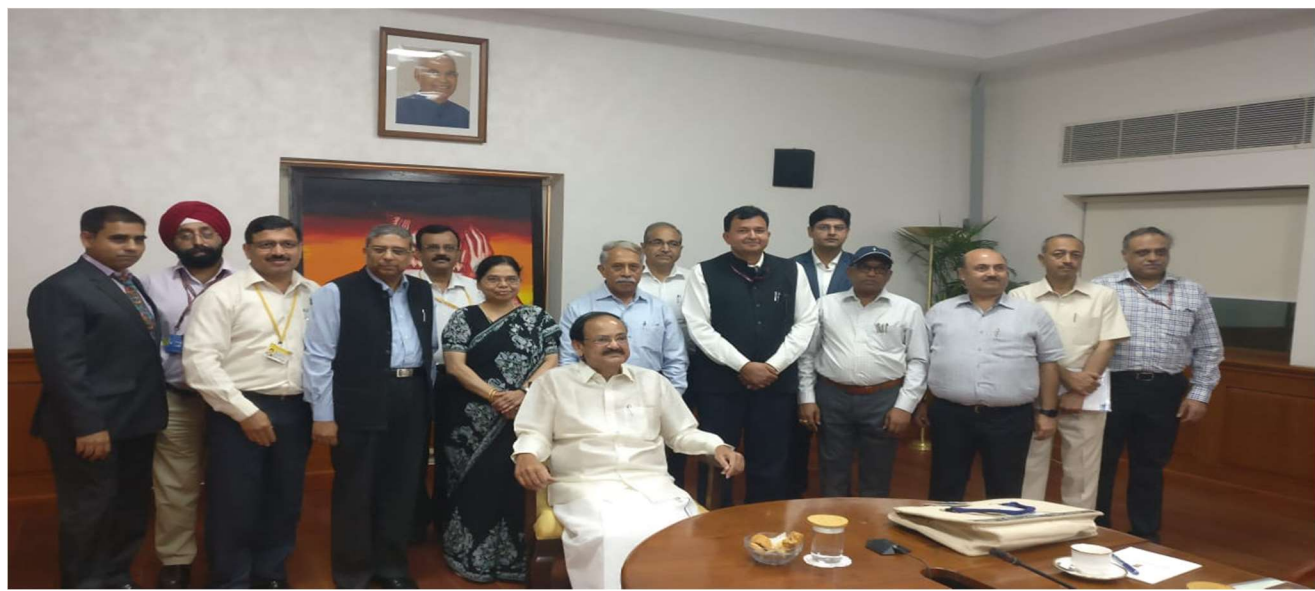
[NeVA Review by Hon'ble Vice-President of India & Chairman Rajya Sabha on 7<sup>th</sup> May, 2019 at Vice President's House, New Delhi]