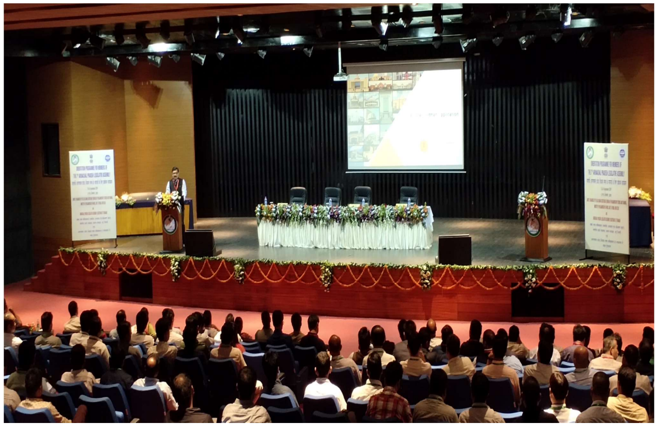
[Joint Secretary, MPA addressing MLAs of Arunachal Pradesh Legislative Assembly during MLAs workshop held on 5^{th} - 6^{th} September, 2019 at Arunachal Pradesh Legislative Assembly, Itanagar ]