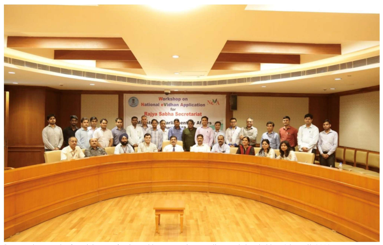
[Group Photograph of Participants of Rajya Sabha Secretariat attending workshop held on 9th April, 2019 atParliament Annexe Building , New Delhi]