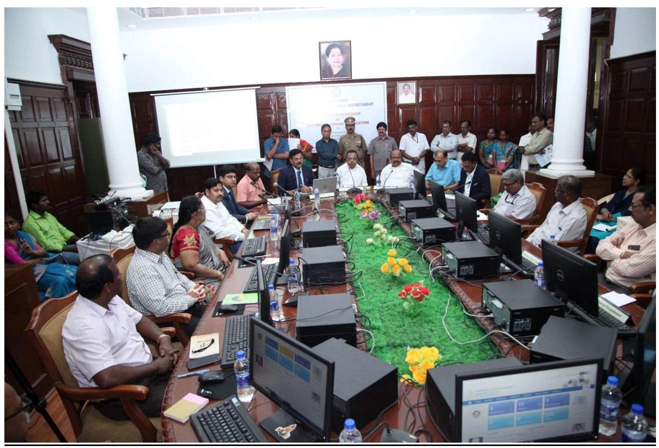
[Phase-I Orientation Workshop held for Tamil Nadu Legislative Assembly on 25th-26th November, 2019 at Telangana Legislative Assembly, Hyderabad]

12.17 In continuation to the earlier capacity building measures, these above mentioned trainings were augmented with the conduction of the three day Phase - II extensive training workshops for 13 Legislative Houses at CPMU NeVA, Annexe Delhi wherein a team of Nodal officers and the staff from the different states, which have already undergone Phase I training were subjected to rigorous hands on training cum practical session . The schedule of the workshops conducted in 2019 is tabulated as under:-