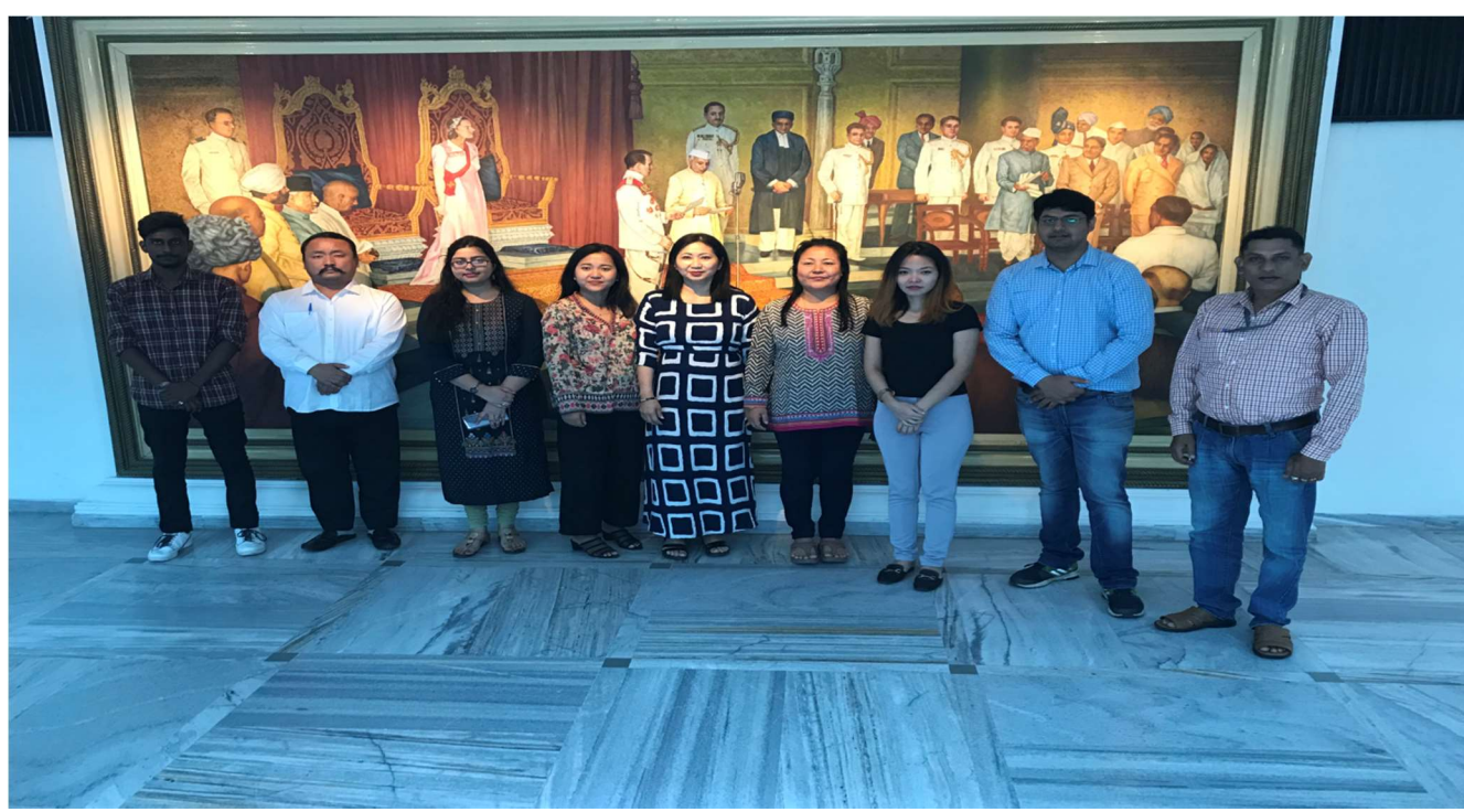
[Group Photograph of Participants of Arunachal Pradesh Legislative Assembly attending Phase-II workshop held on 16<sup>th</sup> -18<sup>th</sup> May, 2019 at CPMU NeVA, Parliament Annexe Building, New Delhi]