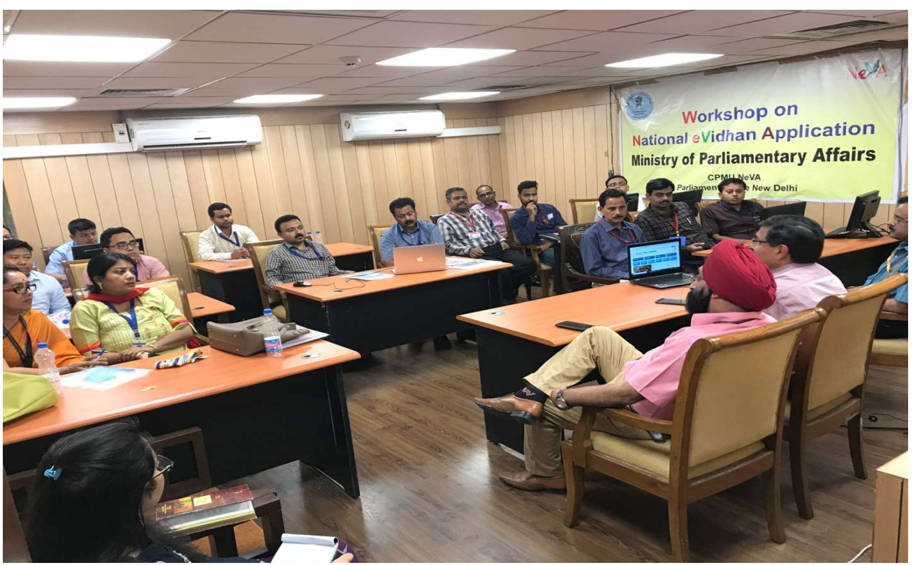
[Joint Secretary, MPA and DDG, NICinteracting with of Participants of Assam Legislative Assembly&West Bengal Legislative Assembly attending Phase-II workshop held on 27<sup>th</sup>-29<sup>th</sup> May, 2019 at CPMU NeVA, Parliament Annexe Building, New Delhi]