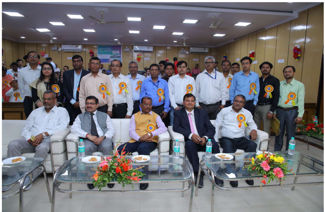
[Phase-I Orientation Workshop held for Jharkhand Legislative Assembly on 26<sup>th</sup> -27<sup>th</sup>March, 2019atJharkhandLegislative Assembly, Ranchi]