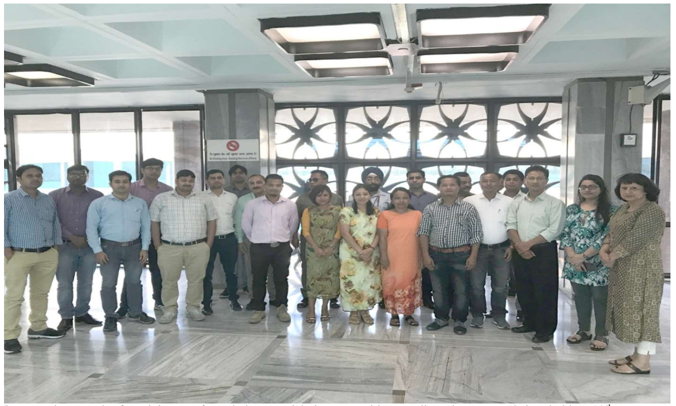
[Group Photograph of Participants of Meghalaya Legislative Assembly attending Phase-II workshop held on 13<sup>th</sup>-15<sup>th</sup>May, 2019 at CPMU NeVA, Parliament Annexe Building , New Delhi]