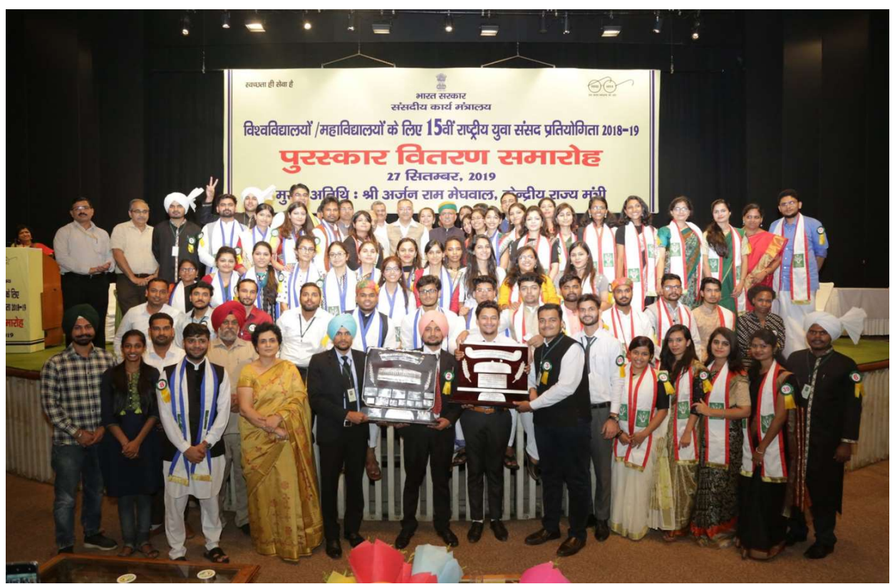
(Shri Arjun Ram Meghwal, the Minister of State for Water Resources, River Development & Ganga Rejuvenation and Parliamentary Affairs & other dignitaries along with the Prize Winning students and teachers of Central University of Punjab, Bathinda)