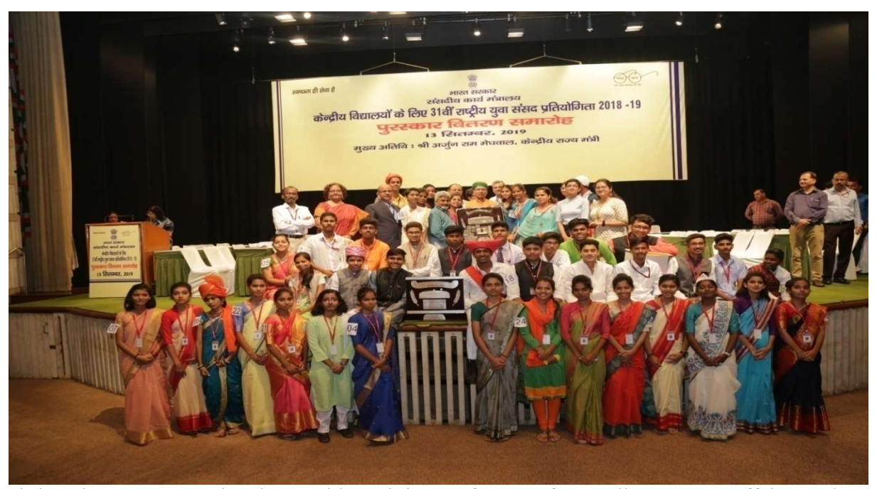
Shri Arjun Ram Meghwal, Hon'ble Minister of State for Parliamentary Affairs and Heavy Industries and Public Enterprises and other dignitaries along with Teachers & Students of Kendriya Vidyalaya, NDA, Khadakwasala, Pune.

10.5The Prize Distribution function of the 31<sup>st</sup> National Youth Parliament Competition, 2018-19 for KendriyaVidyalayas was held on 13<sup>th</sup> September, 2019 at GMC Balayogi Auditorium, Parliament Library Building, New Delhi. Shri Arjun Ram Meghwal, Hon'ble Minister of State for Parliamentary Affairs and Heavy Industries and Public Enterprises presided over the function and distributed the prizes to the Prize Winners. Kendriya Vidyalaya, NDA, Khadakwasala, Pune was awarded the Nehru Running Parliamentary Shield for standing first in the competition on this occasion. Four KendriyaVidyalayas were awarded the Zonal Winner Trophies for their meritorious performance in their respective Zones and 20 Vidyalayas were awarded Merit trophies for their outstanding performance at regional level.