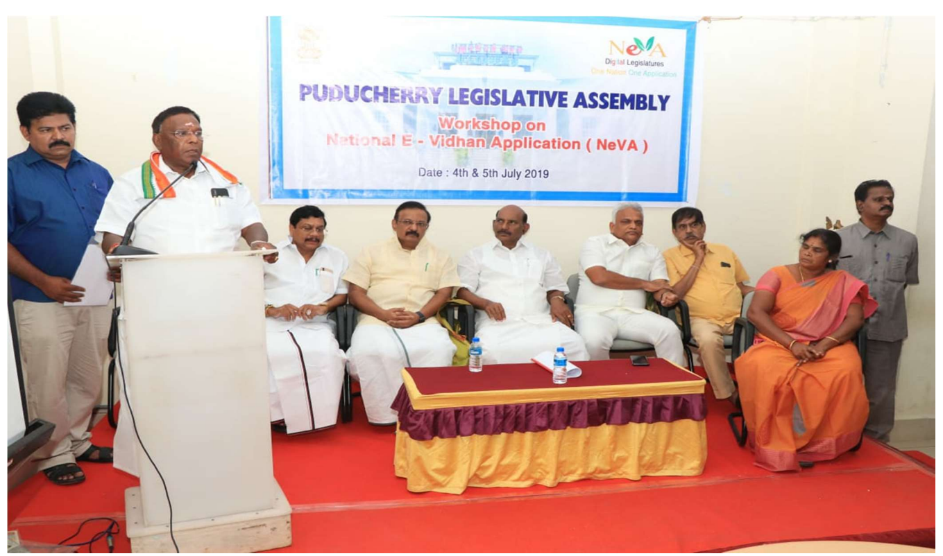
[V.Narayanasamy, Chief Minister, Puducherry addressing Phase-I Orientation Workshop held for Puducherry Legislative Assembly on 4<sup>th</sup>-5<sup>th</sup> July, 2019 at Puducherry Legislative Assembly, Puducherry]