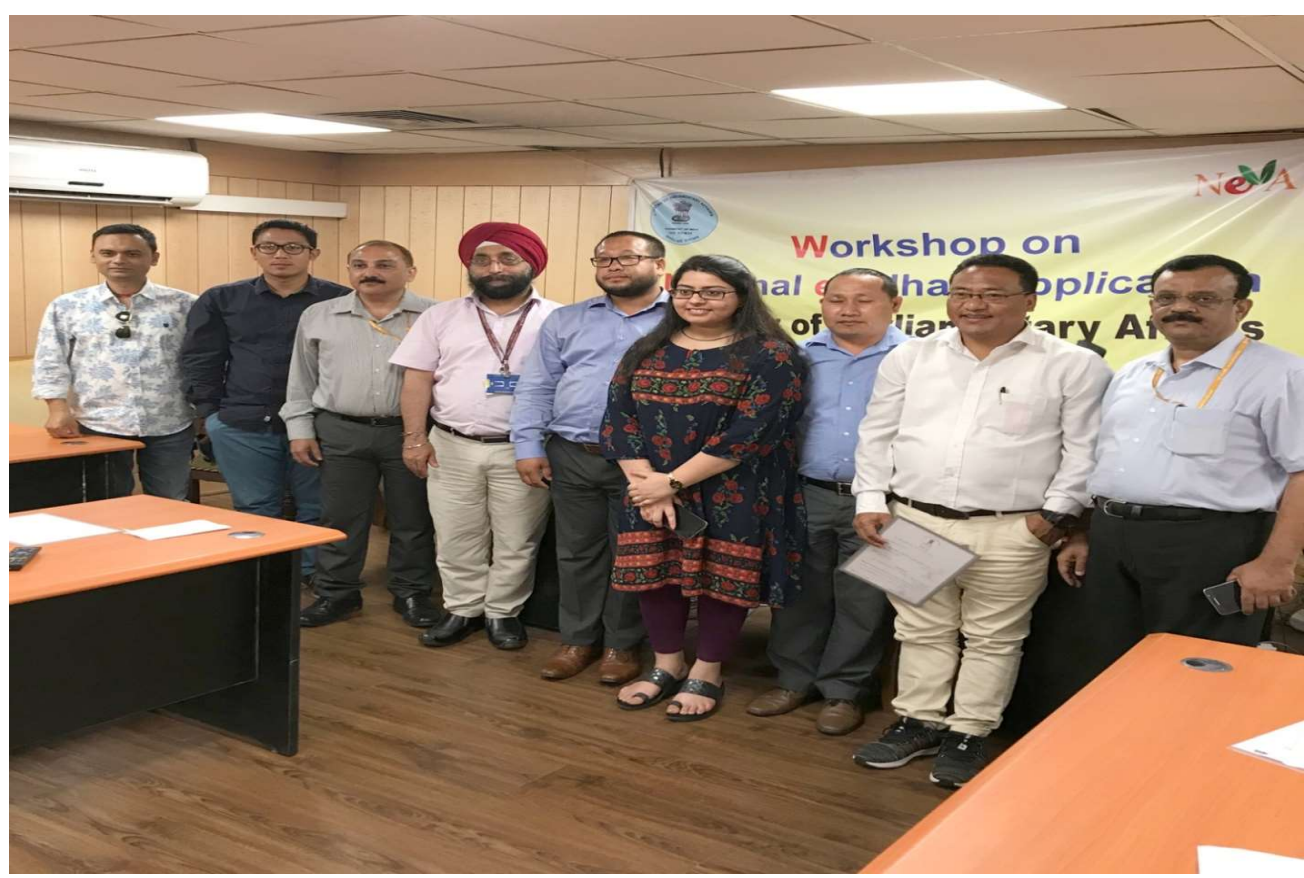
[Group Photograph of Participants of Manipur Legislative Assembly attending Phase-II workshop held on 22th – 24th April, 2019 at CPMU NeVA, Parliament Annexe Building, New Delhi]