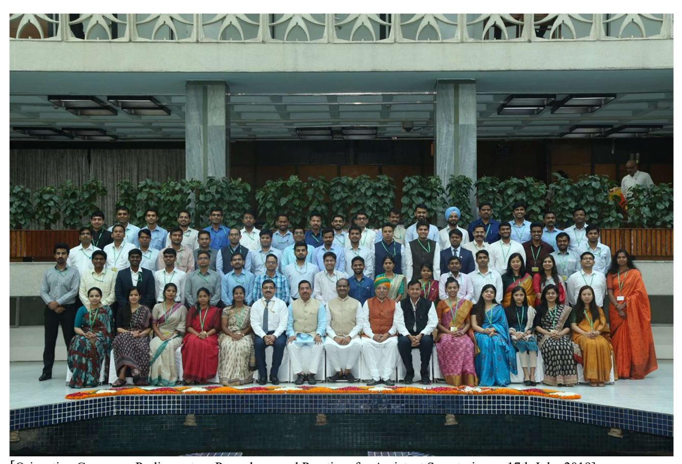
[Orienation Course on Parliamentary Procedures and Practices for Assistant Secretaries on 17th July, 2019]

Parliamentary Affair. Two technical sessions were organized for Assistant Secretaries, the first Power Point Presentation was made by the Joint Secretary, MPA on Parliamentary Practice and Procedure in which he explained to the participants, the technicalities and intricacies of the Parliamentary matters. The second Presentation was made by the Secretary, MPA on National E-VidhanApplication(NeVA). Secretary, MPA informed the gathering that major components of e-Vidhan are Paperless Assembly Sessions, Paperless Working of the House Committees & e-Constituency Management. The participating officers displayed great amount of enthusiasm for the entire event. A total of 169 officers took part in the course. The Short Course proved to be immensely useful for the young officers and enriched and enhanced their repository of knowledge and experience.