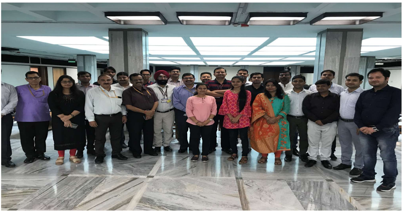
[Secretary & Joint Secretary, MPA reviewing NeVA Progressat CPMU NeVA, Parliament Annexe Building, New Delhi]