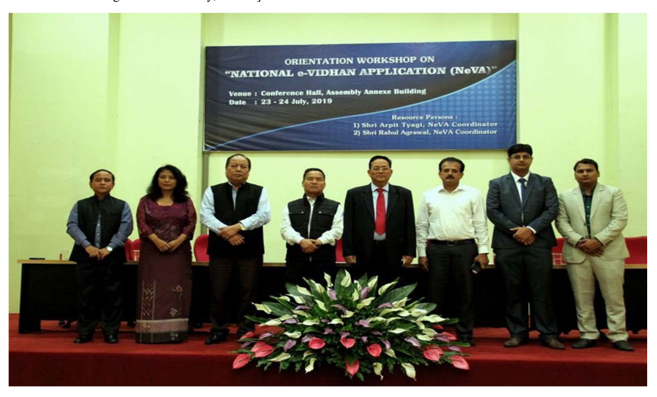
[Phase-I Orientation Workshop held for Mizoram Legislative Assembly on 23^{rd}-24^{th} July, 2019 atMizoram Legislative Assembly, Aizwal]