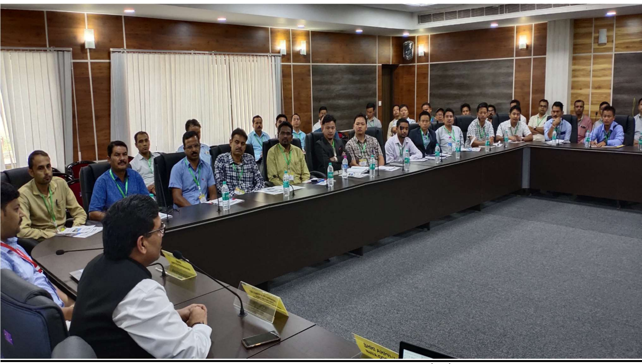
Training of PA/PS of Hon'ble MLAs during Phase-III workshop held on 5<sup>th</sup>-6<sup>th</sup> September, 2019 at Arunachal Pradesh Legislative Assembly, Itanagar ]