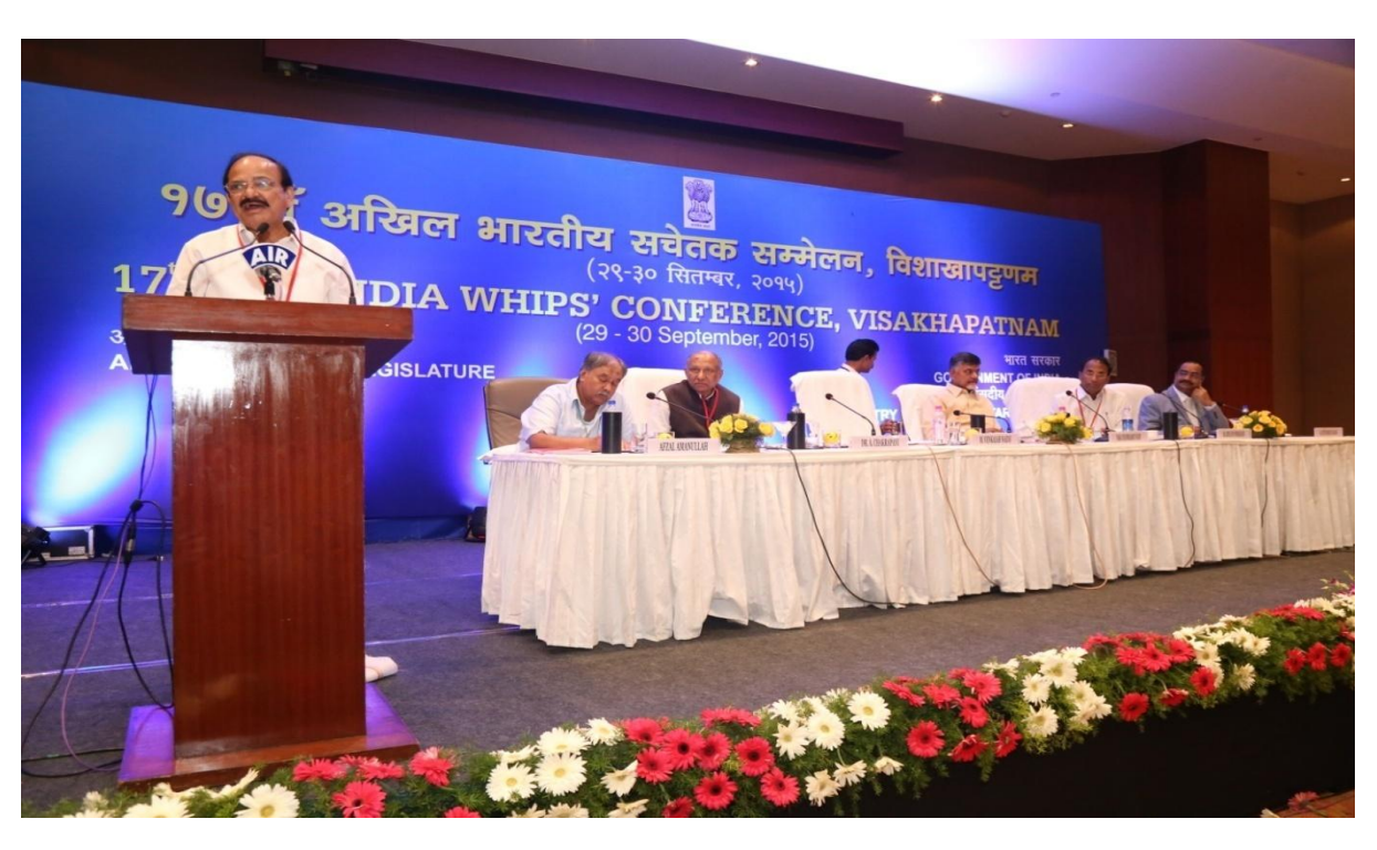
(Inaugural Address by Shri M. Venkaiah Naidu, Minister for Urban Development; Housing and Urban Poverty Alleviation and Parliamentary Affairs during 17<sup>th</sup> All India Whips' Conference at Visakhapatnam)

12.11 The inaugural session was followed by discussion on the Agenda Items on 29<sup>th</sup>-30<sup>th</sup> September, 2015. The Conference deliberated and recommended on four issues namely the review of recommendations of 16<sup>th</sup> All India Whips' Conference, setting up an independent Emoluments Commission, establishment of inter-party forums to resolve problematic issues and need to relook and overhaul the MPLADS. The recommendations of the Conference were presented and adopted unanimously in the concluding session on 30<sup>th</sup> September, 2015. These recommendations aim at achieving uniformity in practices and procedures and improvement in the functioning of the Legislative Bodies in the country. The Conference expressed the view that these recommendations need to be considered and implemented expeditiously.