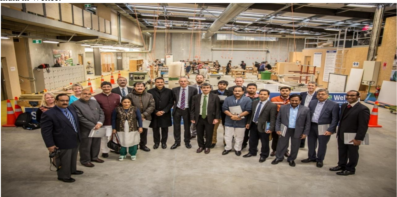
[Delegation at the Weltech Vocational Training and Polytechnic Institute in Wellington]

9.10. The delegation called on the New Zealand Prime Minister, John Key . During the meeting, PM mentioned that both countries share close bilateral ties which are strengthened by their Commonwealth backdrop. PM also informed that there were three members of the Indian community in the New Zealand Parliament which is unicameral. The PM also referred to the desirability of deepening trade ties through early completion of a Free Trade Agreement between both the countries. PM also stated that he was keen to meet the Indian Prime Minister and his office is working on the possibilities during the first quarter of 2016.