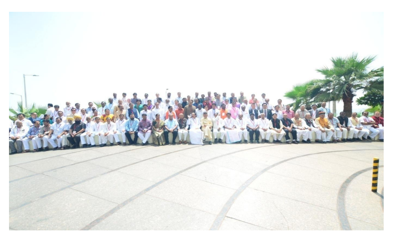
(Group Photograph of delegates attending the 17<sup>th</sup> All India Whips' Conference)