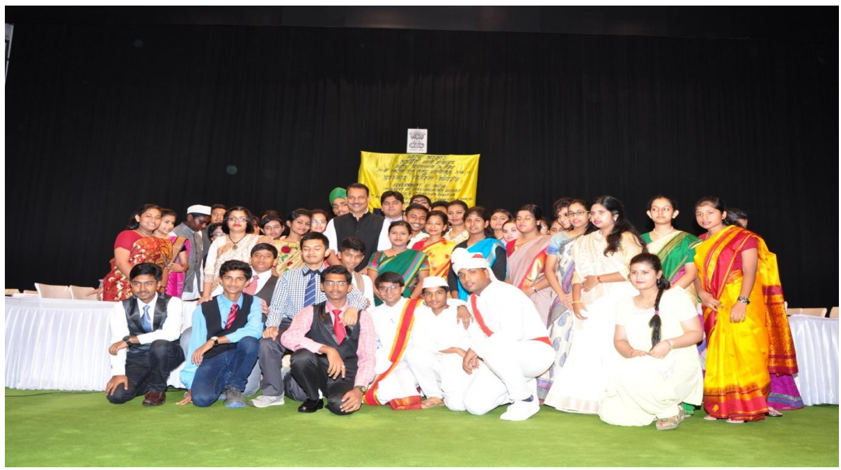
Shri Rajiv Pratap Rudy, Minister of State (Independent Charge) for Skill Development and Entrepreneurship & Minister of State in the Ministry of Parliamentary Affairs along with the Prize Winning students and teachers of Kendriya Vidyalayas on the occasion of Prize Distribution Function of 27<sup>th</sup> National Youth Parliament Competition, 2014-15 held on 10<sup>th</sup> July, 2015 at GMC Balayogi Auditorium, Parliament Library Building, New Delhi.

10.7 Prize Distribution function of the 27<sup>th</sup> National Youth Parliament Competition, 2014-15 was held on 10<sup>th</sup> July, 2015 at GMC Balayogi Auditorium, Parliament Library Building, New Delhi. Shri Rajiv Pratap Rudy, Minister of State (Independent) for Skill Development and Entrepreneurship & Minister of State in the Ministry of Parliamentary Affairs presided over the function and distributed the prizes. Four Kendriya Vidyalayas were awarded Zonal Winner Trophies for their meritorious performance in their respective zones and 20 Vidyalayas were awarded Merit Trophies for their outstanding performances at Regional Level. Besides, Certificates and individual prizes were also awarded to 950 prize winning students of the participating Kendriya Vidyalayas (750 students for their meritorious performances at Regional level and 200 students at National level).