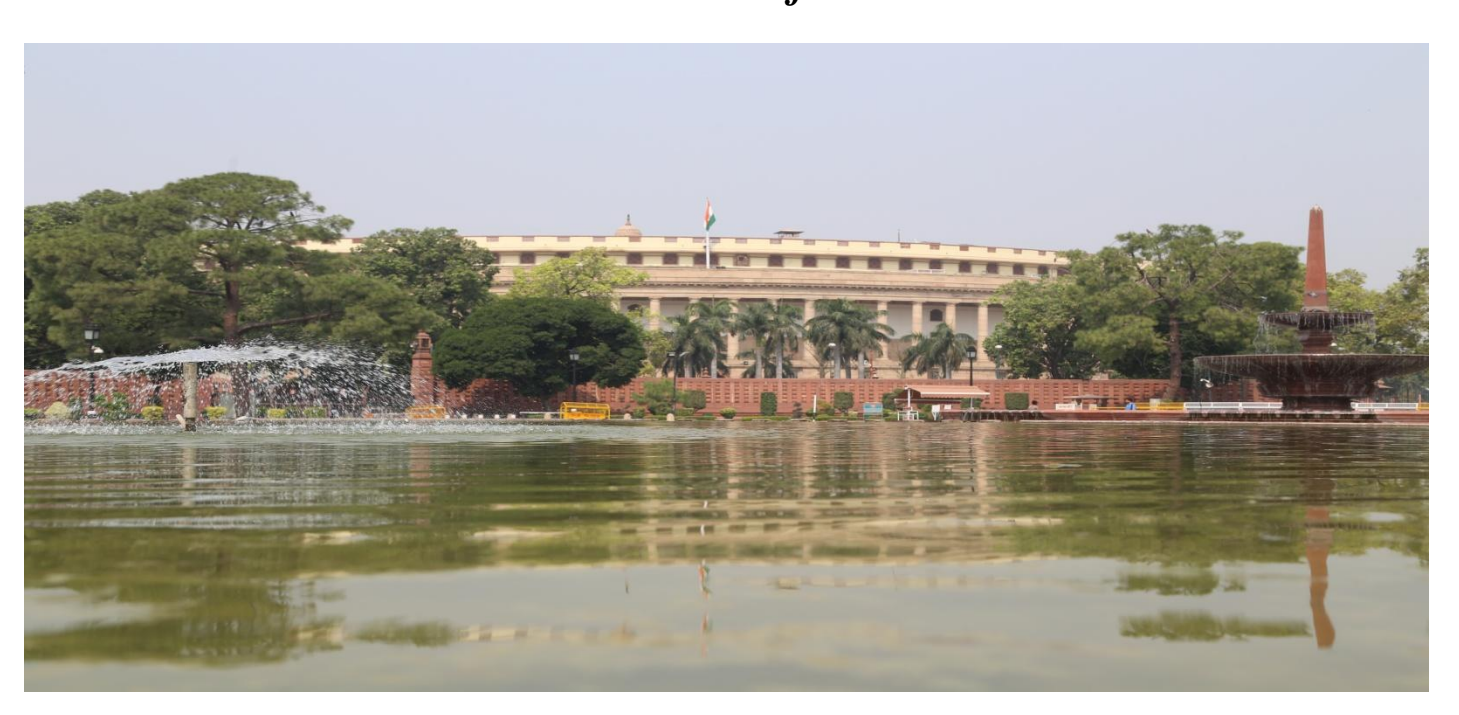
संसदीय कार्य मंत्रालय नई दिल्ली Ministry of Parliamentary Affairs New Delhi