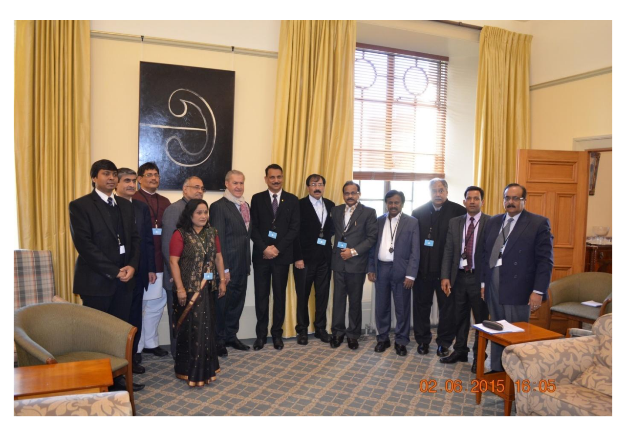
[Delegation called on Hon. David Carter, Speaker of New Zealand Parliament]

9.11. On 3<sup>rd</sup> June, the delegation called on Hon. David Carter, Speaker of New Zealand Parliament . Speaker expressed satisfaction that the delegation would have had the opportunity to witness the New Zealand Parliament in Session during the Question Hour and to experience how the Westminster model of Parliamentary democracy was guiding the political processes in New Zealand and compare that with India. MoS endorsed the view that both countries had similar Parliamentary systems and also pointed out that the scale of democratic process in India was very large. MoS also mentioned about use of electronic voting machines to complete counting of votes in record time of a few hours. MoS also elaborated upon the various Parliamentary procedures applicable in both Houses of Indian Parliament including the roles of the Speaker and Deputy Speaker and Panel Chairman. The New Zealand Speaker then sought to emphasize on signing FTA between both the countries.