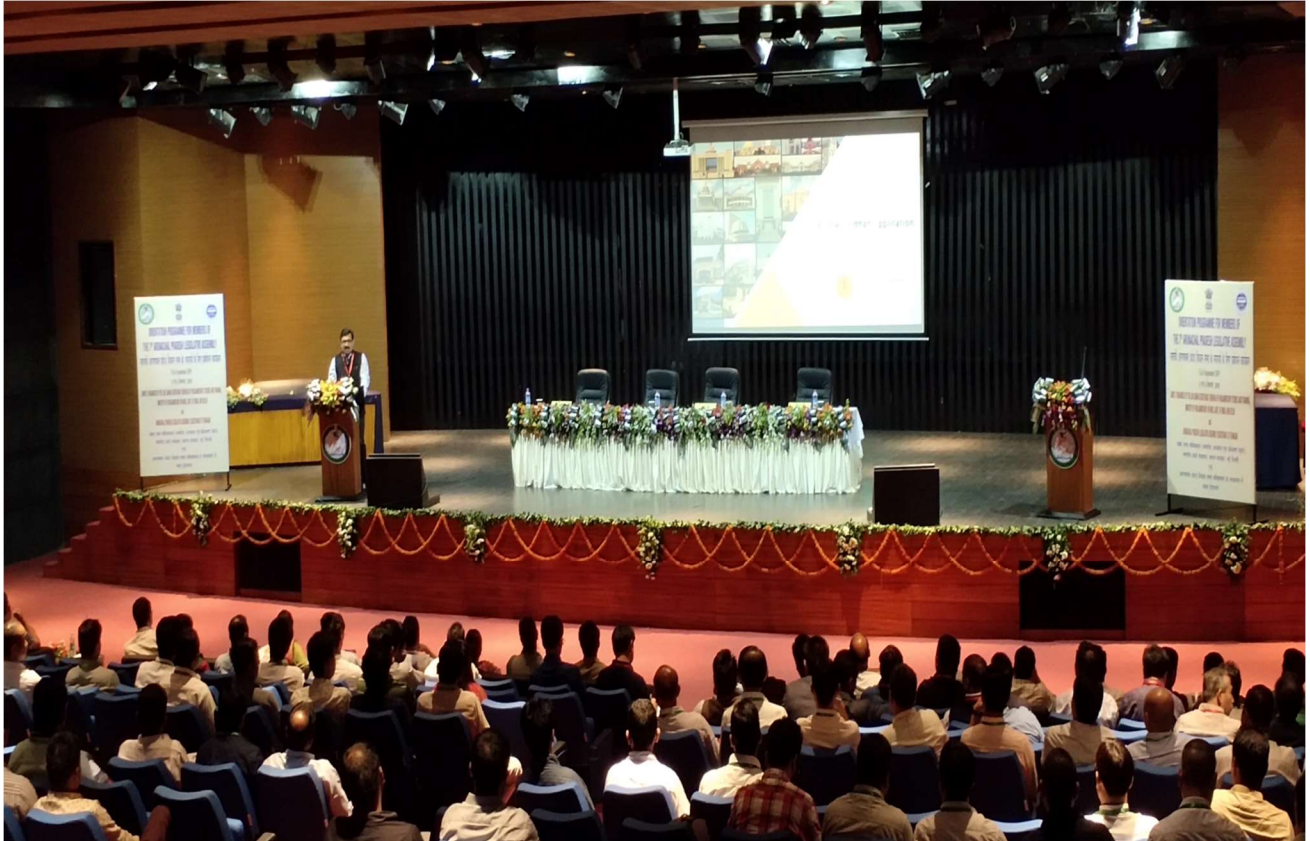
[Joint Secretary, MPA addressing MLAs of Arunachal Pradesh Legislative Assembly during MLAs workshop held on 5 th -6 th September, 2019 at Arunachal Pradesh Legislative Assembly, Itanagar ]