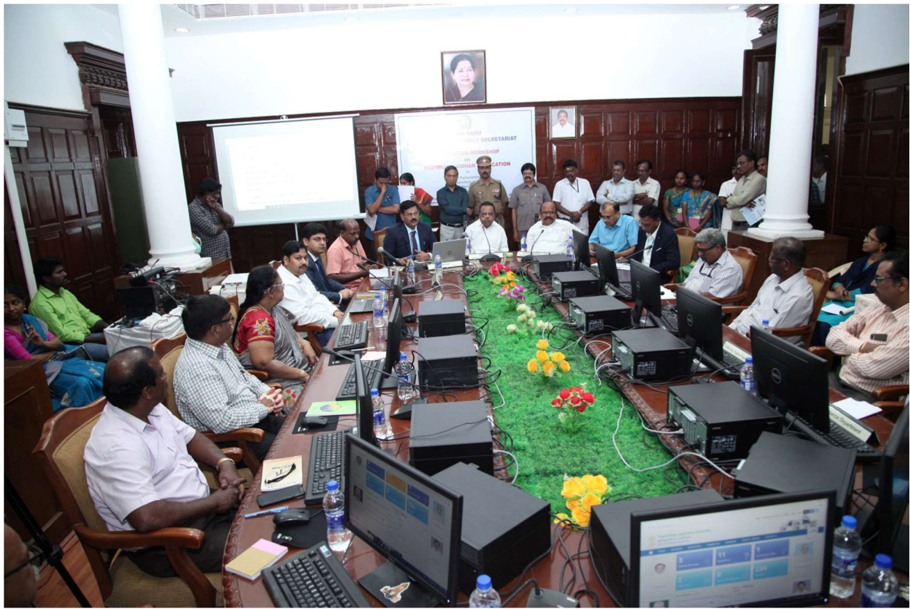
[Phase-I Orientation Workshop held for Tamil Nadu Legislative Assembly on 25 th -26 th November, 2019 at Telangana Legislative Assembly, Hyderabad]

12.17 In continuation to the earlier capacity building measures, these above mentioned trainings were augmented with the conduction of the three day Phase - II extensive training workshops for 13 Legislative Houses at CPMU NeVA, Annexe Delhi wherein a team of Nodal officers and the staff from the different states, which have already undergone Phase I training were subjected to rigorous hands on training cum practical session . The schedule of the workshops conducted in 2019 is tabulated as under:-