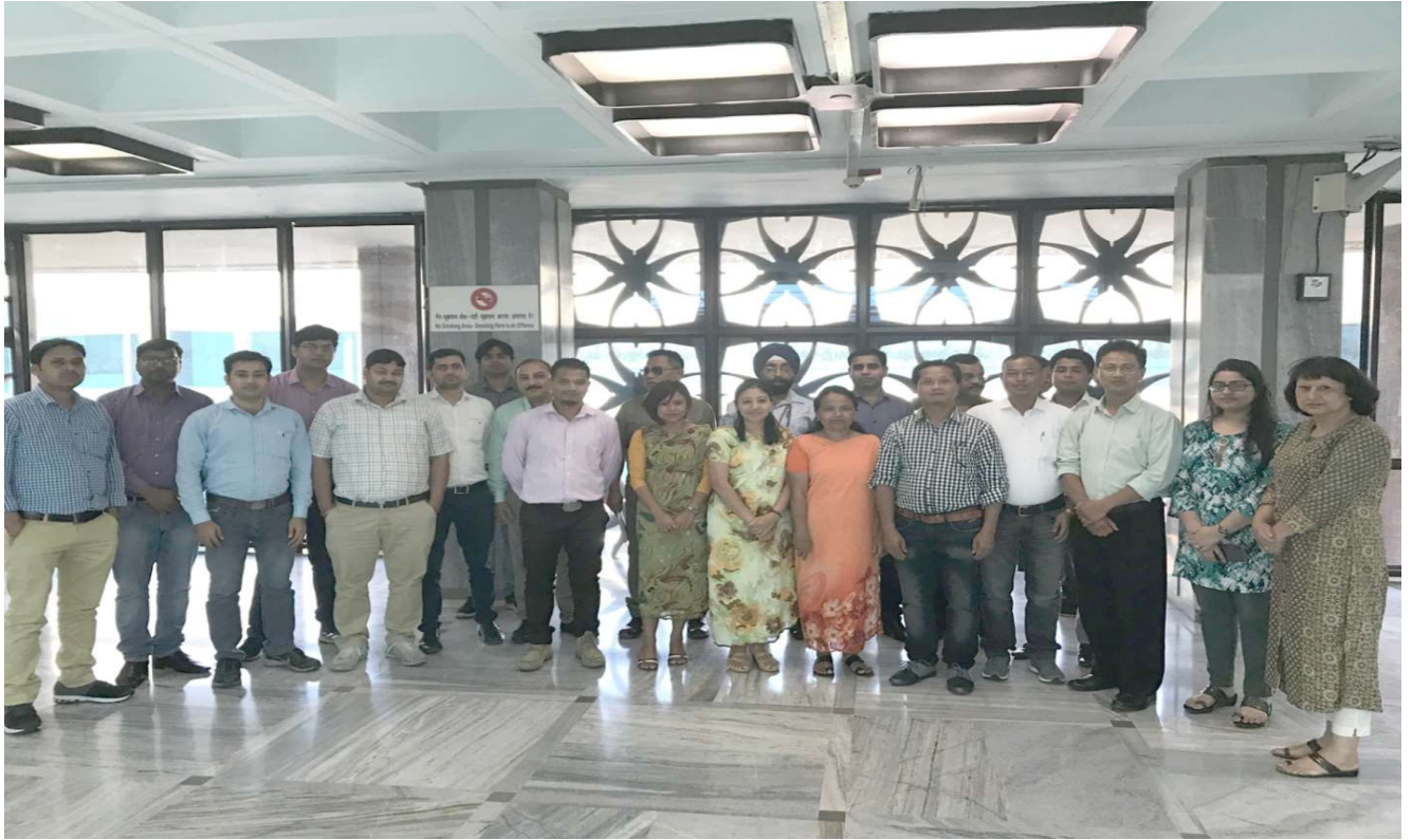
[Group Photograph of Participants of Meghalaya Legislative Assembly attending Phase-II workshop held on 13 th -15 th May, 2019 at CPMU NeVA, Parliament Annexe Building , New Delhi]