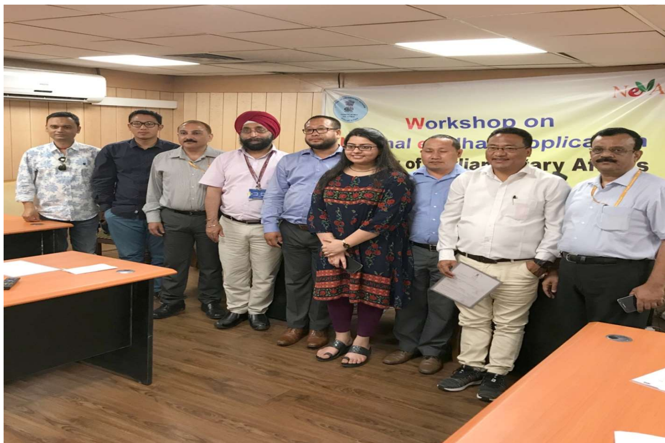
[Group Photograph of Participants of Manipur Legislative Assembly attending Phase-II workshop held on 22th – 24th April, 2019 at CPMU NeVA, Parliament Annexe Building , New Delhi]