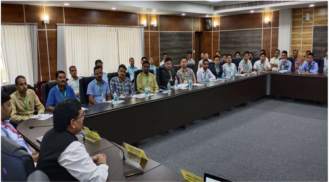
[Training of PA/PS of Hon'ble MLAs during Phase-III workshop held on 5 th -6 th September, 2019 at Arunachal Pradesh Legislative Assembly, Itanagar ]