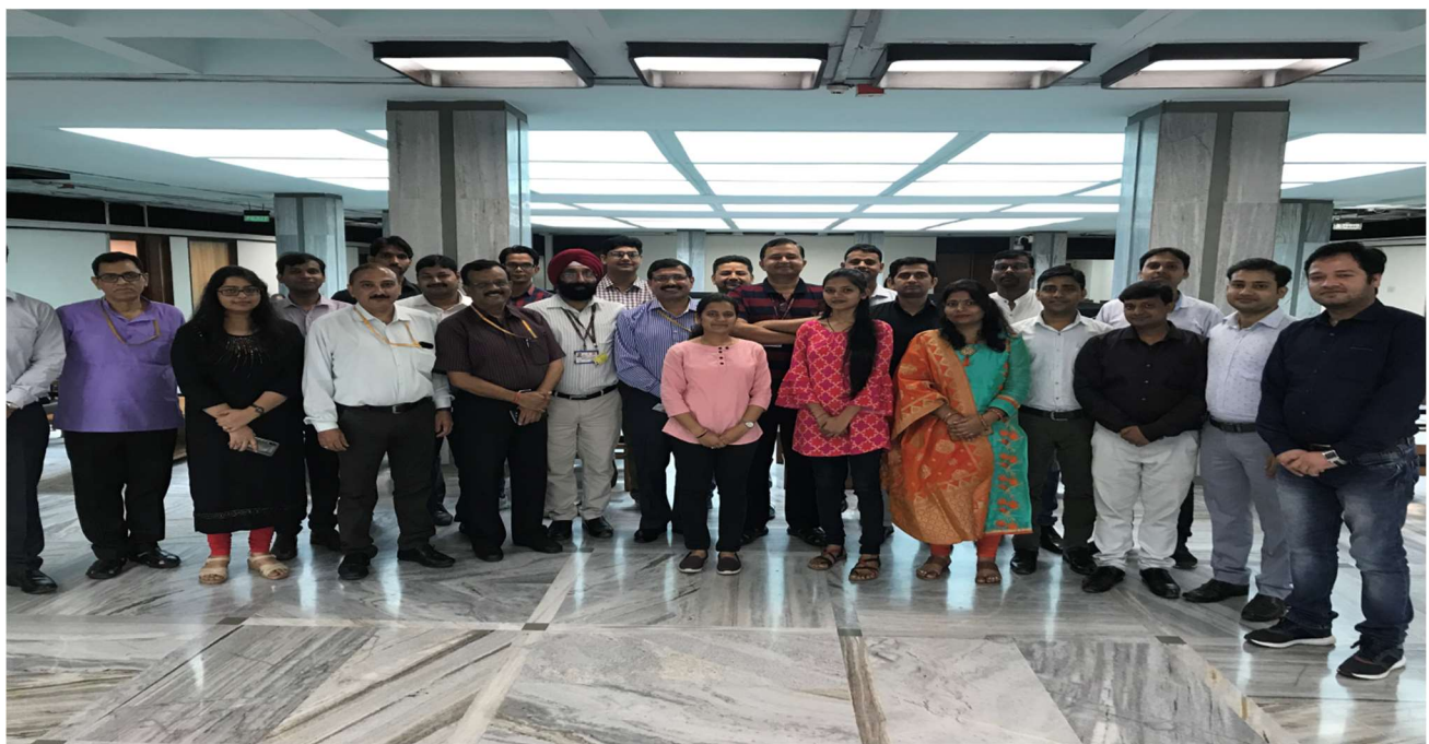
[Secretary & Joint Secretary, MPA reviewing NeVA Progress at CPMU NeVA, Parliament Annexe Building, New Delhi]