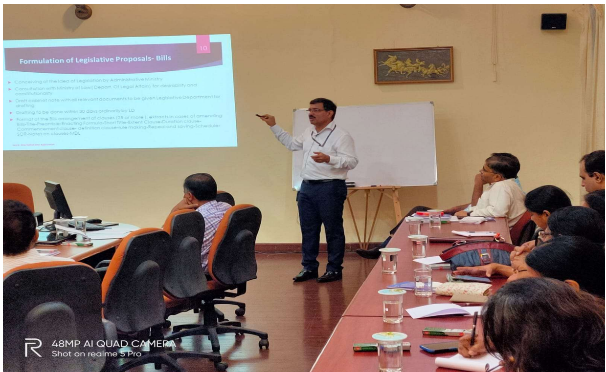
(Orientation workshop was held for officers/officials of the Department of Atomic Energy, Mumbai on 04.10.2019)