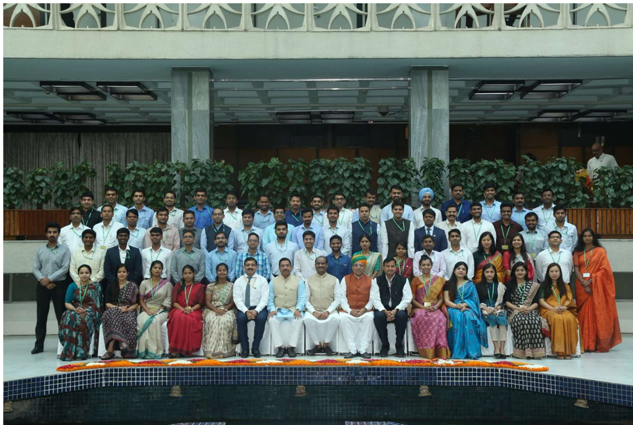
[Orientation Course on Parliamentary Procedures and Practices for Assistant Secretaries on 17th July, 2019]

Parliamentary Affair. Two technical sessions were organized for Assistant Secretaries, the first Power Point Presentation was made by the Joint Secretary, MPA on Parliamentary Practice and Procedure in which he explained to the participants, the technicalities and intricacies of the Parliamentary matters. The second Presentation was made by the Secretary, MPA on National E-Vidhan Application (NeVA). Secretary, MPA informed the gathering that major components of e-Vidhan are Paperless Assembly Sessions, Paperless Working of the House Committees & e-Constituency Management. The participating officers displayed great amount of enthusiasm for the entire event. A total of 169 officers took part in the course. The Short Course proved to be immensely useful for the young officers and enriched and enhanced their repository of knowledge and experience.