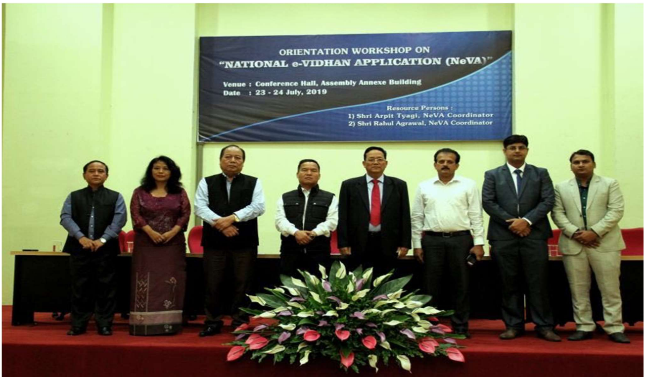
[Phase-I Orientation Workshop held for Mizoram Legislative Assembly on 23 rd – 24 th July, 2019 atMizoram Legislative Assembly, Aizwal]