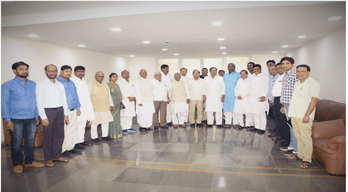
[Training of of Hon'ble MLCs during Phase-III workshop held on 3 rd June, 2019 at Bihar Legislative Council, Patna]

12.37 Bihar Legislative Council became the first house in the country where through NEVA (National e-Legislative Application) software, honorable members can ask their starred, unstarred and notified questions etc. Council Secretariat is accepting Online Questions submitted by MLCs through NeVA Mobile & Web Platform. Questions are also processed through NeVA Question Processing System and final list for the Questions is prepared online through workflow based NeVA architecture. Even the Questions are sent to the Departments online and Departments have facility to send its reply online.