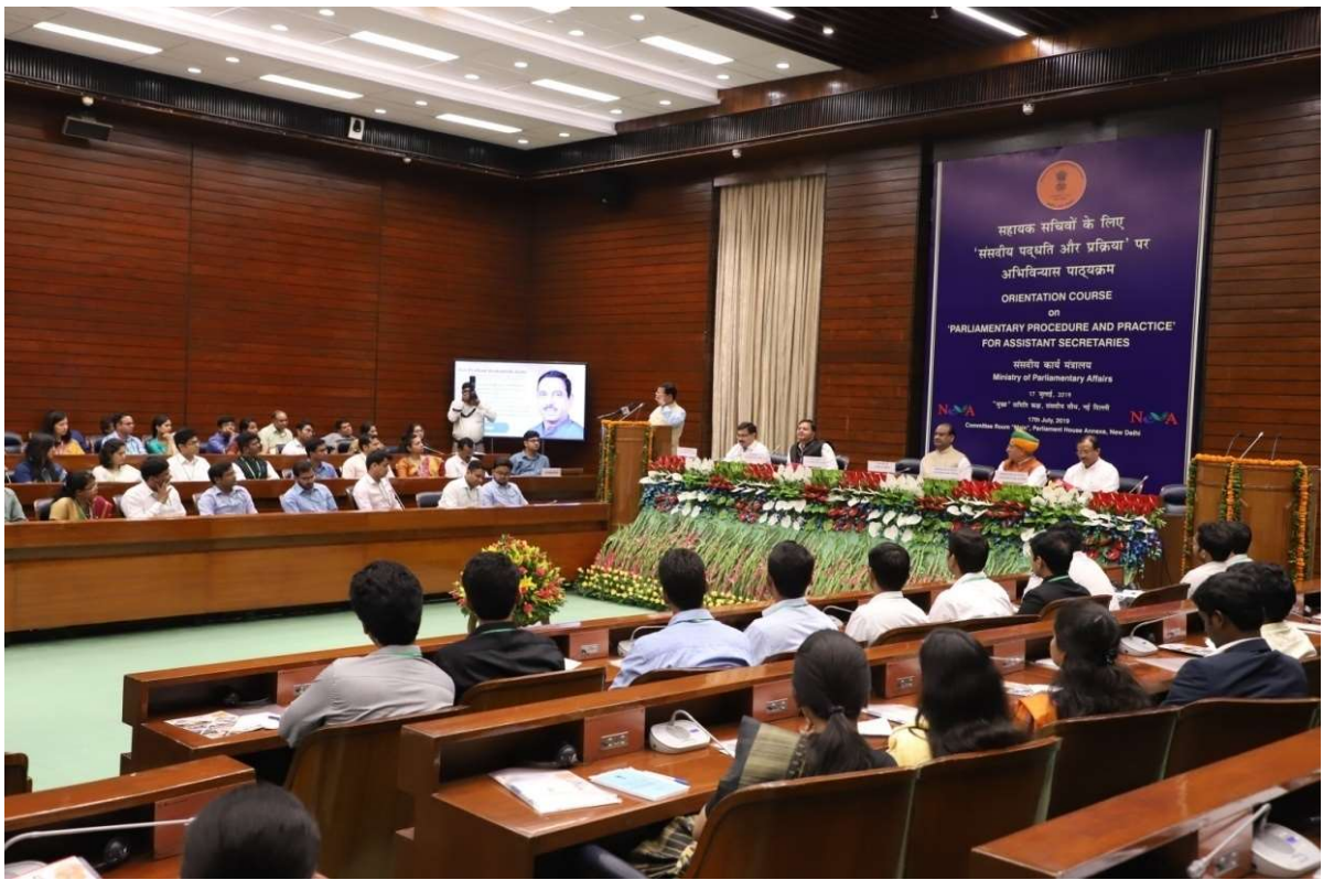
(Orientation Workshop was held in Parliament House on 17 th July, 2019 for fresh IAS officers of 2017 Batch)