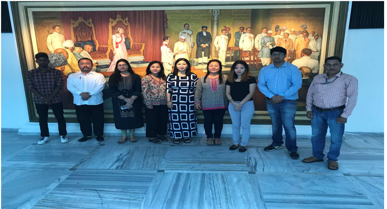
[Group Photograph of Participants of Arunachal Pradesh Legislative Assembly attending Phase-II workshop held on 16 th -18 th May, 2019 at CPMU NeVA, Parliament Annexe Building , New Delhi]