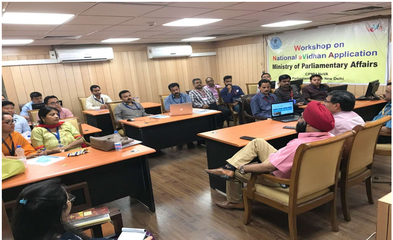
[Joint Secretary, MPA and DDG, NIC interacting with of Participants of Assam Legislative Assembly & West Bengal Legislative Assembly attending Phase-II workshop held on 27 th -29 th May, 2019 at CPMU NeVA, Parliament Annexe Building, New Delhi]