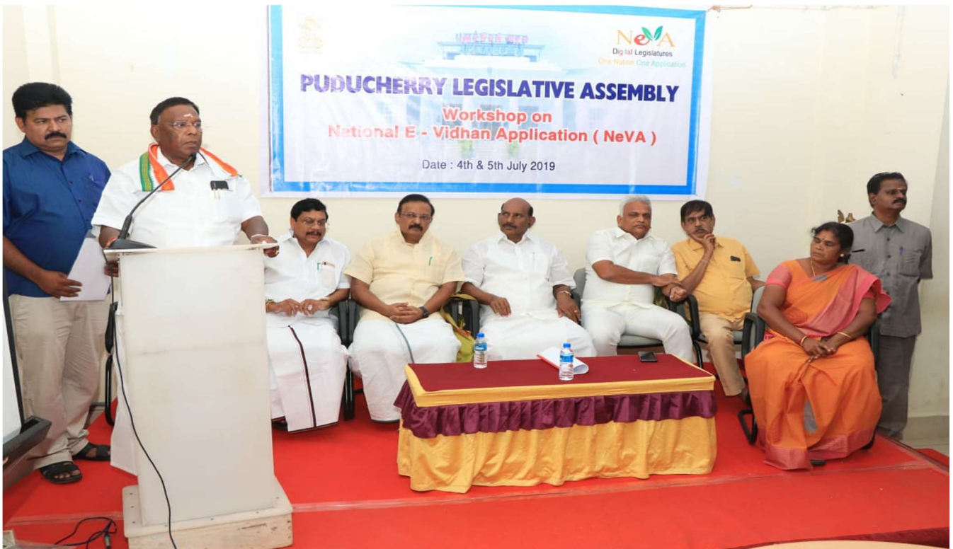
[V.Narayanasamy, Chief Minister, Puducherry addressing Phase-I Orientation Workshop held for Puducherry Legislative Assembly on 4 th -5 th July, 2019 at Puducherry Legislative Assembly, Puducherry]