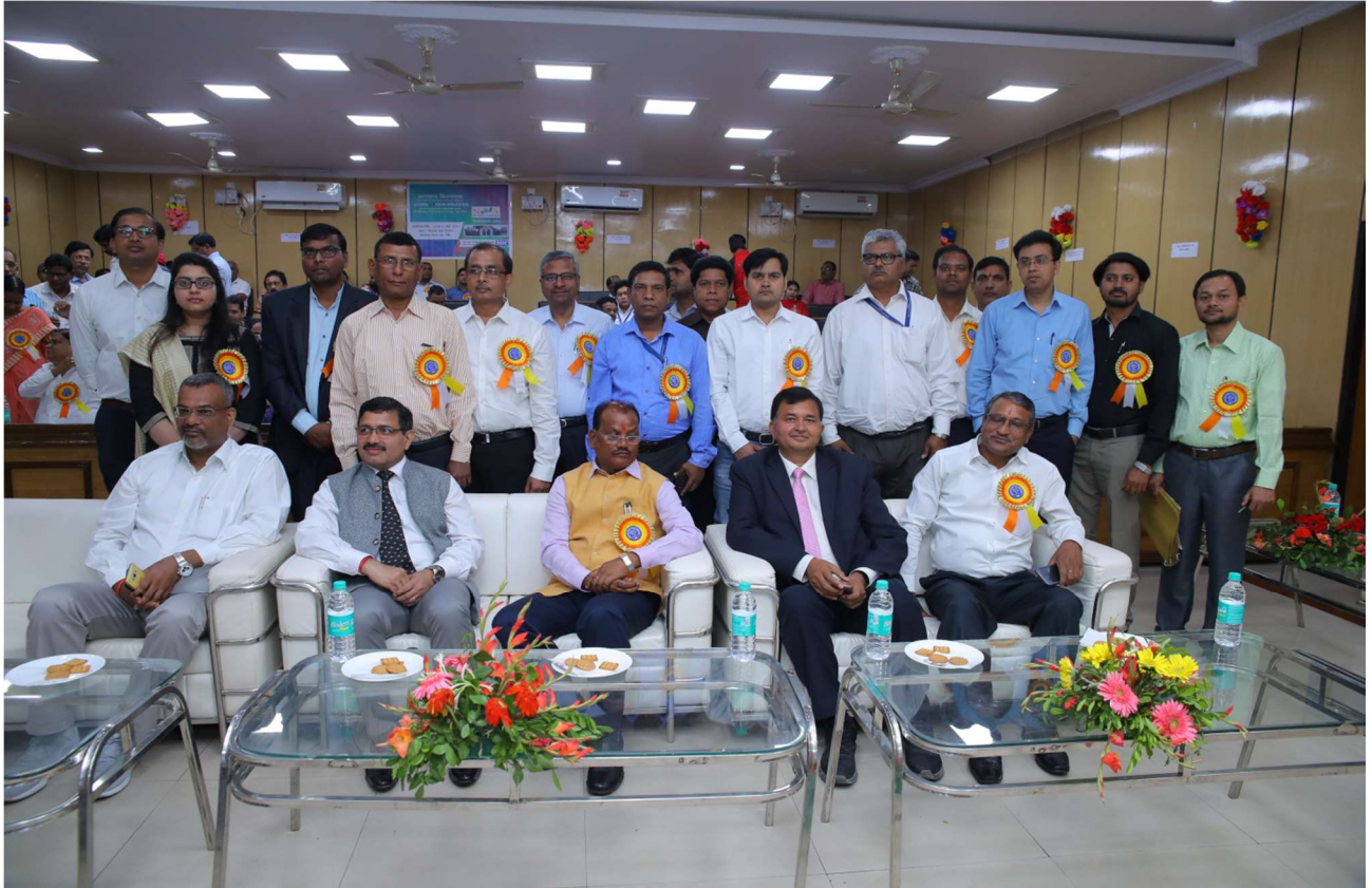
[Phase-I Orientation Workshop held for Jharkhand Legislative Assembly on 26 th -27 th March, 2019atJharkhandLegislative Assembly, Ranchi]