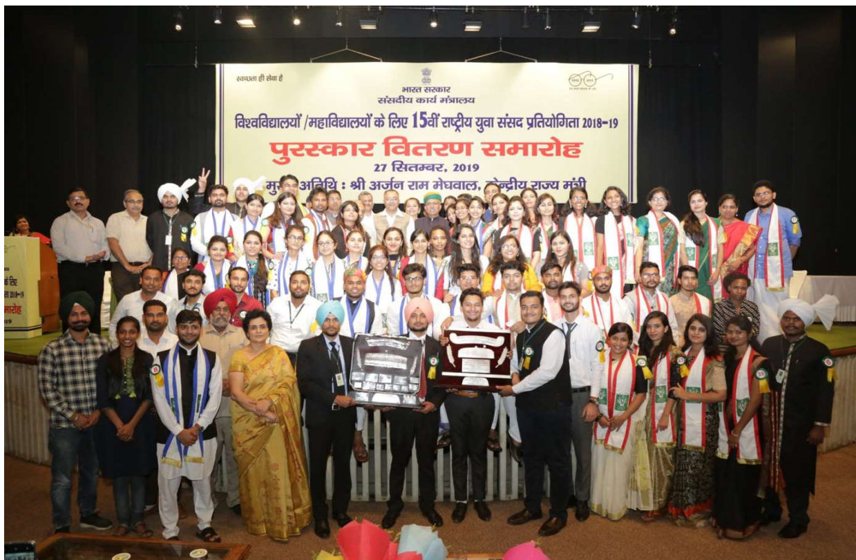
(Shri Arjun Ram Meghwal, the Minister of State for Water Resources, River Development & Ganga Rejuvenation and Parliamentary Affairs & other dignitaries along with the Prize Winning students and teachers of Central University of Punjab, Bathinda)