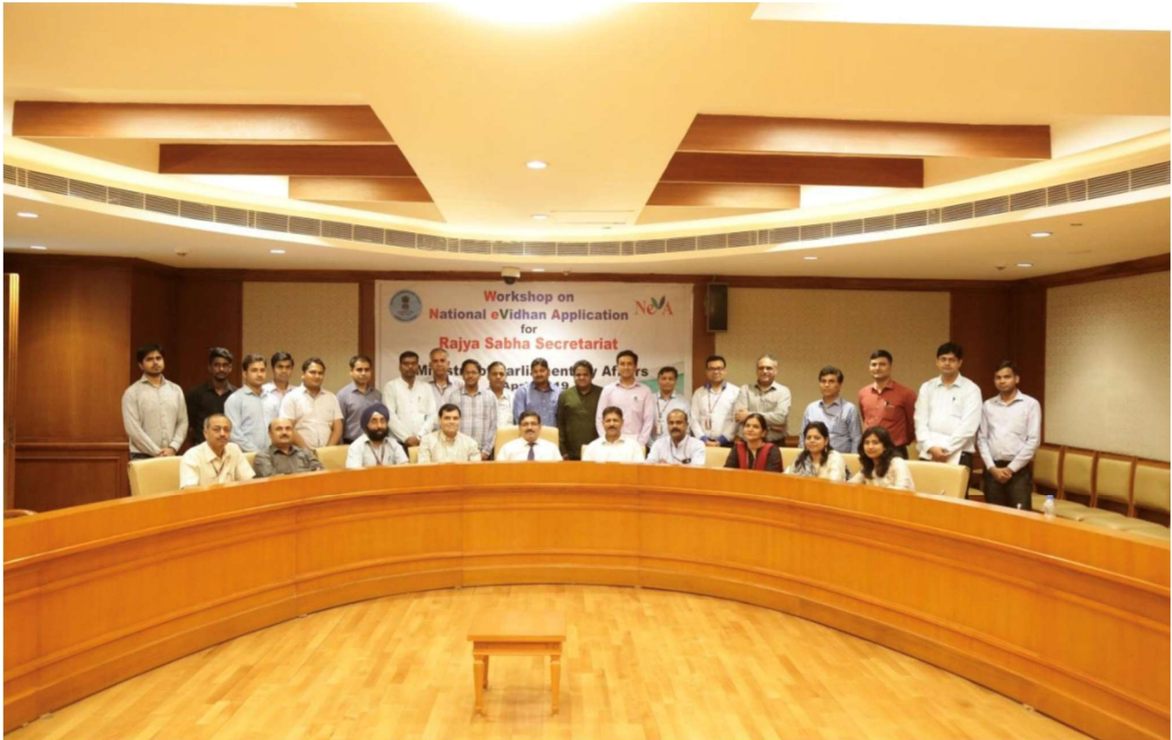
[Group Photograph of Participants of Rajya Sabha Secretariat attending workshop held on 9th April, 2019 at Parliament Annexe Building , New Delhi]