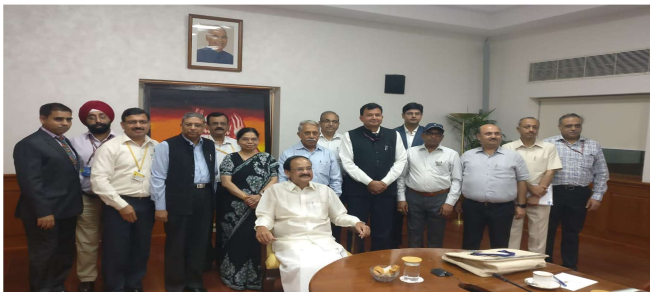
[NeVA Review by Hon'ble Vice-President of India & Chairman Rajya Sabha on 7 th May, 2019 at Vice President's House, New Delhi]

12.31 The session concluded with vote of thanks and the valediction from the Chair wherein he appreciated the initiative and efforts taken by MoPA in the direction of digitising the legislatures through the development of the NeVA application. Besides this, Chair expressed that NeVA application is a tool to handle and assist the Members in transaction of the Government Business in the House and desired that Officers from both the Secretariats could sit together to find out the feasibility of using NeVA in their respective Houses.